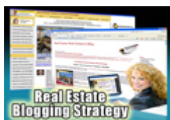
Real Estate Blogging Strategy Training