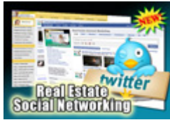
Real Estate Social Networking Training