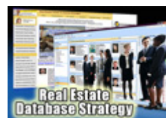
Real Estate Database Strategy Training