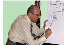
Key Yessaad Training on Internet Marketing