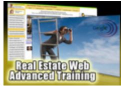
Real Estate Web Advanced Training