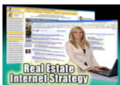
Real Estate Internet Strategy Training